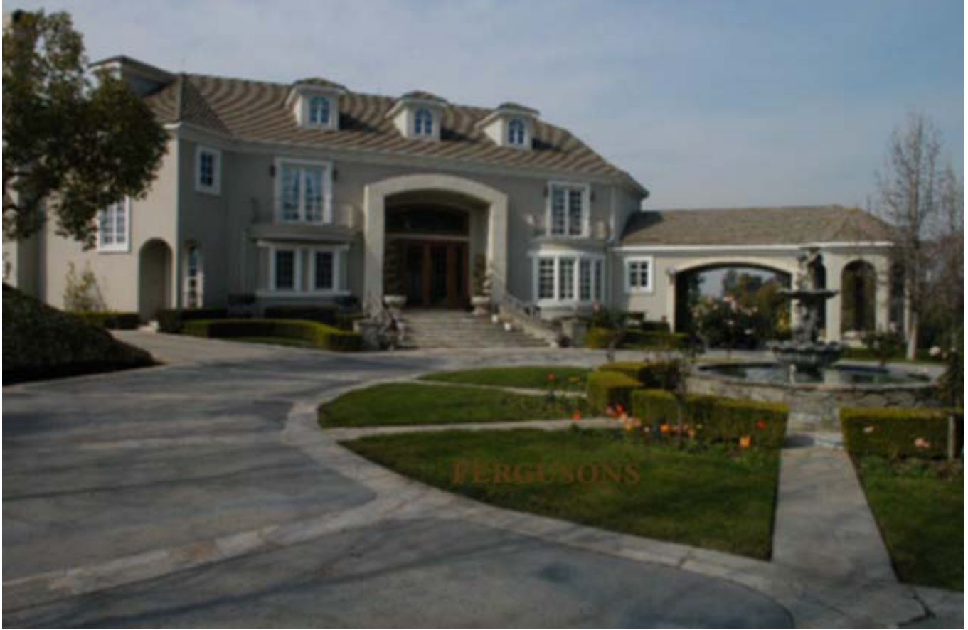
Very large and spread out with Separate Multi-car Garages