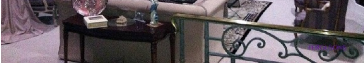
ARCHITECTURAL DETAILS throughout